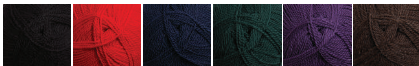
BLACK TRADITIONAL RED MIDNIGHT BLUE PINE GRAPE NAT DARK